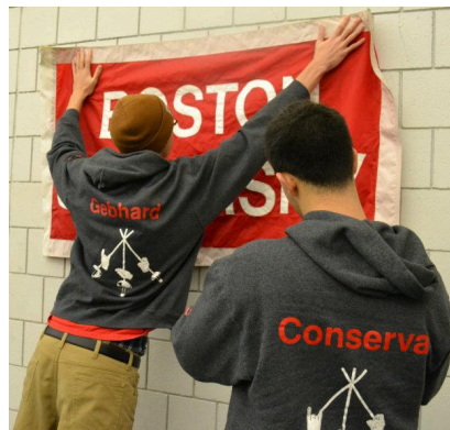
Sweatshirts and "new" flag