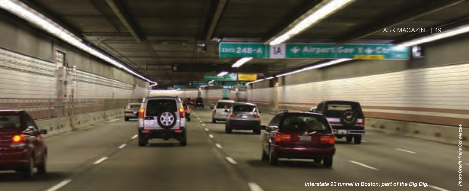
Interstate 93 tunnel in Boston, part of the Big Dig.