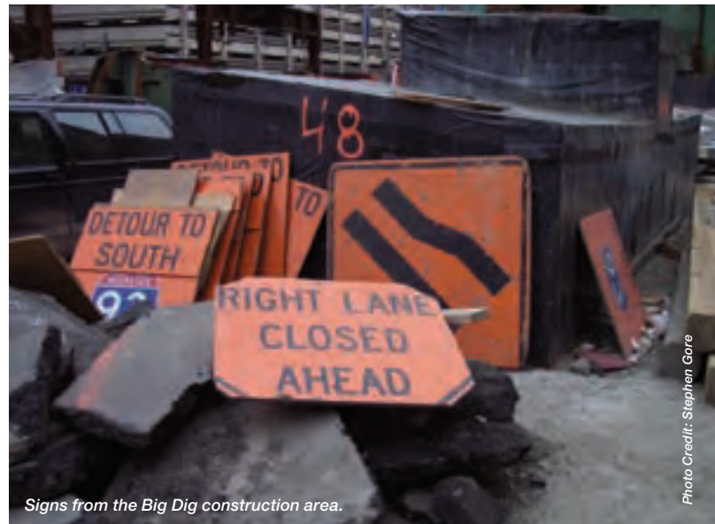
Signs from the Big Dig construction area.

Partnering at the Big Dig was initially implemented in 1992, primarily on construction contracts, but its success in construction led to its use elsewhere. Almost one hundred partnerships existed on the Big Dig, based on contract values