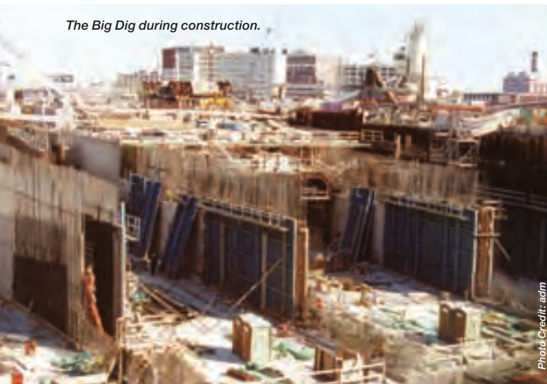
The Big Dig during construction.

Problems in integration resulted in part from the sheer number of internal and external stakeholders, their interactions, and the ever-changing dynamics of managing the relationships. Each of the Big Dig’s 110 major contracts involved intensely complicated technical, legal, and economic issues and numerous processes and procedures as well as a complex regulatory scheme. The Big Dig may have suffered not from too few processes